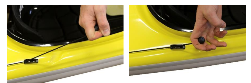
Pull up and then back to deploy the race rudder.