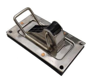
Andersen Bailer - Closed and Locked Position