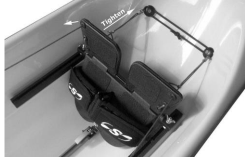
Loosen the line = more reclined pedals