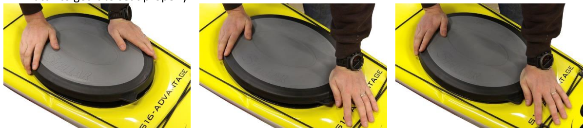
Line up the centerline and work around from one end to the other and check the complete edge is down

• The oval bow and stern hatches provide a water-tight seal in the bow and stern compartments, but it is necessary that the hatches are put on correctly. Start by lining up the ends of the hatch and then push one end down and work your way up towards the other until the hatch is fully engaged. The rim of the hatch should not bump out anywhere along the outside. To find the center line it helps to rotate the hatch to get it to seat properly.