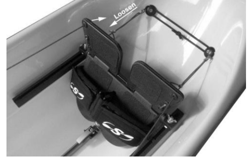
Tighten the line = more vertical pedals

• To adjust the angle of the footbrace pedals, untie the steering lines from the bow bulkhead. If you wish to adjust the foot pedals to a more vertical position, tighten the line. If you wish for them to move towards the bow, loosen the steering line. Make sure to check the rudder alignment if you adjust the tension on the rudder line. If it is out of alignment, you can adjust the tension on one line to bring it in line.